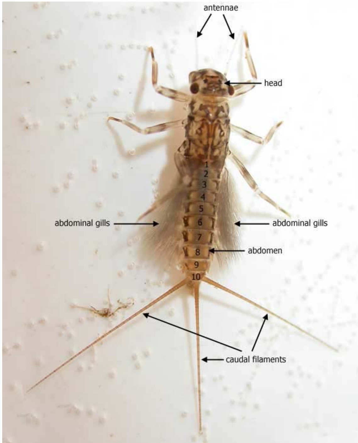
whole nymph - dorsal view