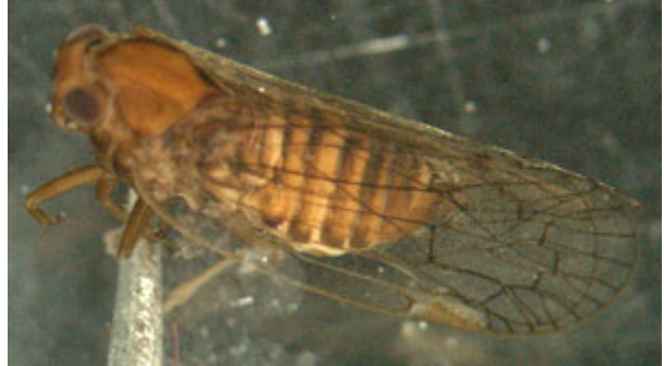
Long toughened wings (but not thickened elytra)