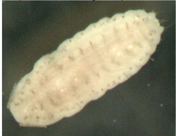
Soft, pale bodies from living in damp, dark leaf litter