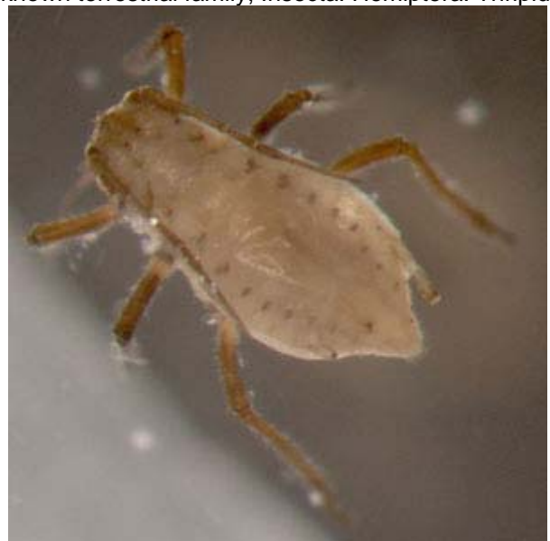
A known terrestrial family, Insecta: Hemiptera: Thripidae

From: Insects of Australia CSIRO 1991 pg 988