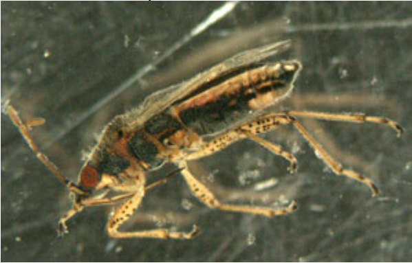
Lack of adaptations to life in the water