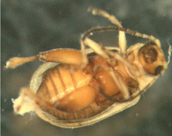
Hind legs well developed for jumping