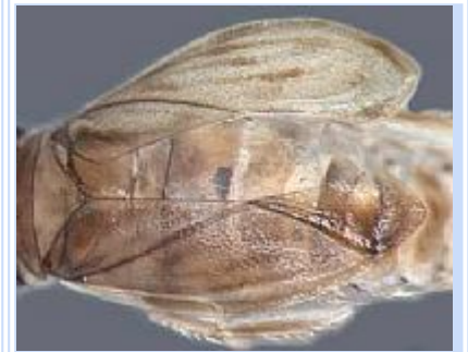
Hemiptera - winged adult

-Animals without wings, not capable of flight BUT INCLUDING nymphs and larvae with developing wing pads (WP)