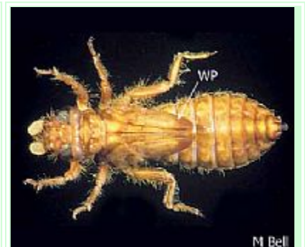
Odonata - larva