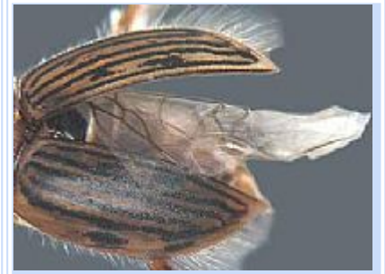
Coleoptera - winged adult