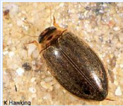
Coleoptera - winged adult