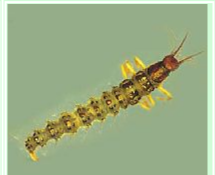
Neuroptera - larva