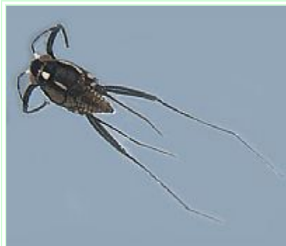
Hemiptera - wingless adult