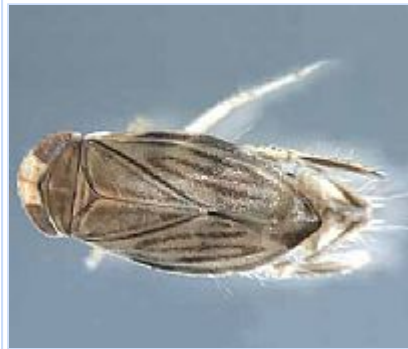
Hemiptera - winged adult