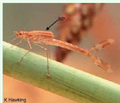
Odonata - nymph